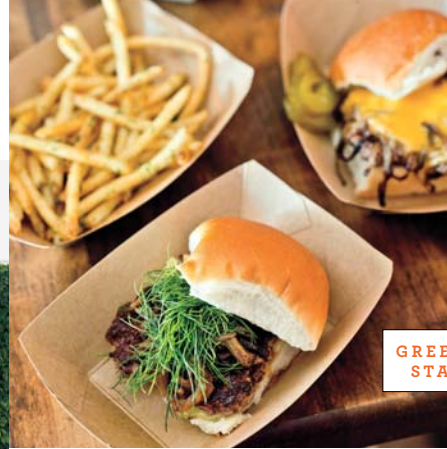
GREEN DOT STABLES