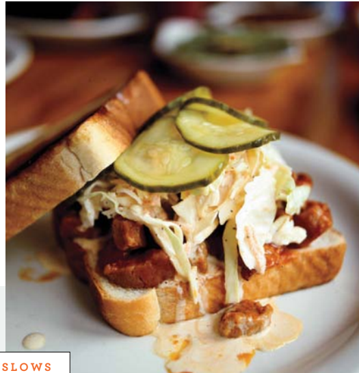
SLOWS BAR B Q

TRAVEL 411 Corktown is a 10-minute walk from downtown and a 30-minute cab ride from the airport.